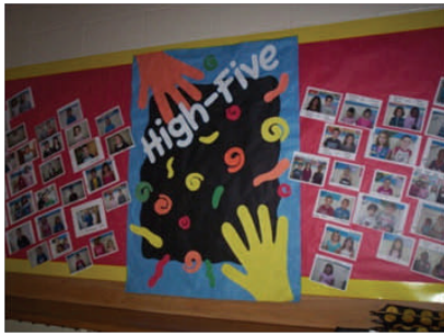
Tate Woods High Five Board in front hallway