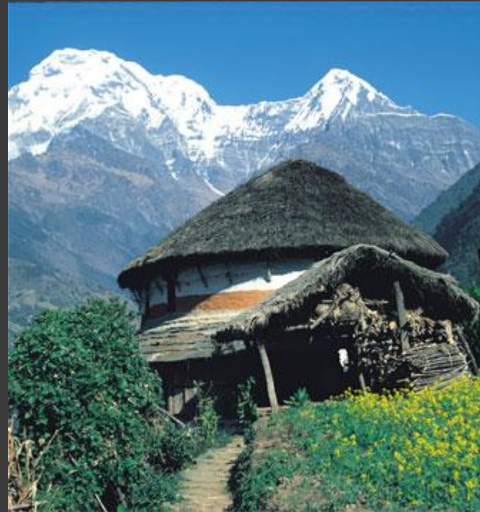
Buddhist Monastery Nepal